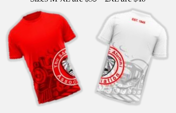
The New SACAA Shirts are in Stock Sizes M-XL are $35 2XL are $40

I would suggest purchasing via MobileAssist to automatically secure your order as inventory is updated. Or come to the office and purchase. Also, these run a bit large so there is a bit more room, see the designs below: