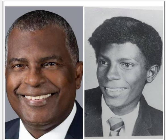
Frederick Mitchell, Fox Hill (Minister of Foreign Affairs and the Public Service)